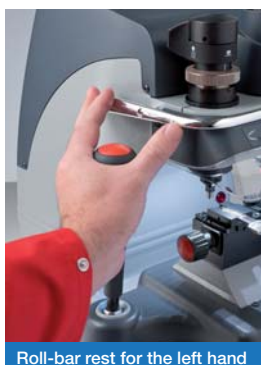
Roll-bar rest for the left hand

The roll-bar rest for the left hand provides the Operator with ideal and comfortable working conditions.