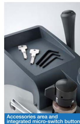
Accessories area and integrated micro-switch button