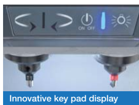
Innovative key pad display

With Matrix One, you will be able to accurately and easily cut a wide range of laser and dimple keys, without the need of optional accessories. Narrow stem vehicle keys and Fichet® type keys can be duplicated with Silca's specific optional adapters.